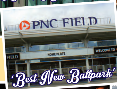
'Best New Ballpark'