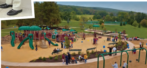
Parks & Boundless Playgrounds