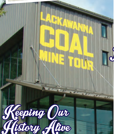
Keeping Our History Alive