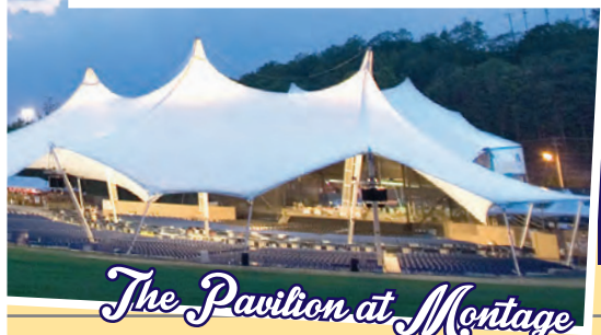
The Pavilion at Montage