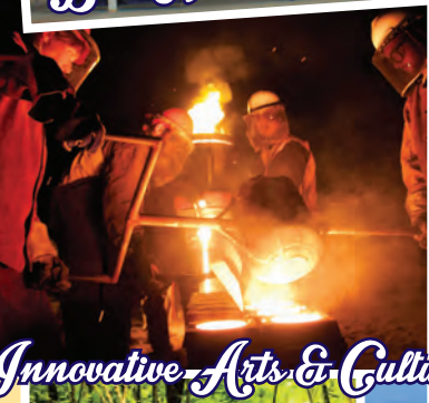
Innovative Arts & Culture