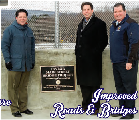
Improved Roads & Bridges