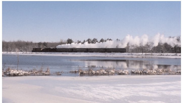
View of the Steamtown NHS Ice House Excursion in 2005.

No. 1. Historic tools will be used to cut and gather blocks of ice from the pond. The Pocono Mountains Chapter of the National Railway Historical Society will offer light refreshments.