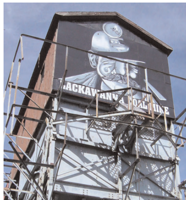
The Lackawanna County Coal Mine will restore the Coal Tipple with assistance from LHVA grant funds.

The Major Partnership Grants support major implementation or planning projects with requests between $5,000 and $50,000. The Educational Mini-Grant Education Program 2006-2007 will involve more than 1,000 Pre-K to high school students in Northeastern Pennsylvania in projects that focus on the region's heritage and/or natural resources. Ten projects each will receive a $500 grant.