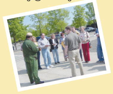
A group of Heritage Ambassadors are welcomed to the Steamtown National Historic Site.

Ambassadors' Programs run one day every month from May to September. If you know of anyone interested in becoming an "Ambassador," please contact LHVA at (570) 963-6730 or email heritage@LHVA.org.