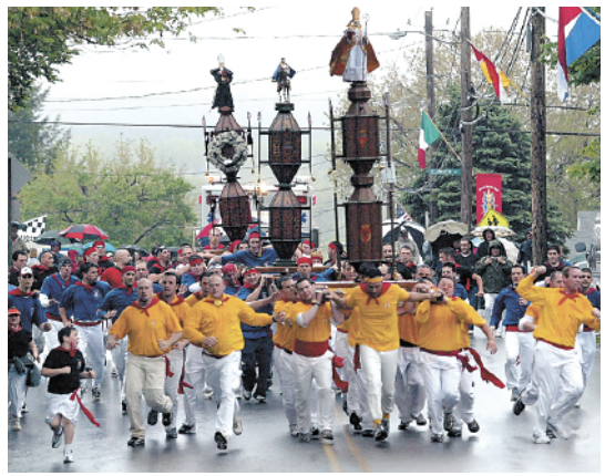
"The Race of the Saints" is one of the highlights of Jessup's annual Italian festival, "La Festa dei Ceri."

Station Stops program, and has awarded a grant to the Borough of Jessup to support the festival itself.