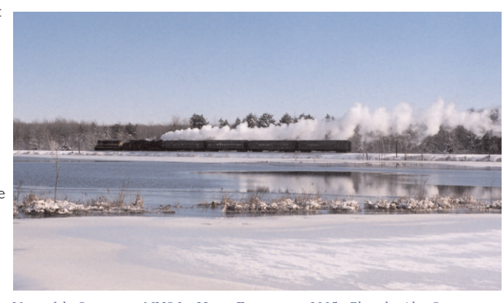
View of the Steamtown NHS Ice House Excursion in 2005.

No. I. Historic tools will be used to cut and gather blocks of ice from the pond.The Pocono Mountains Chapter of the National Railway Historical Society will offer light refreshments.