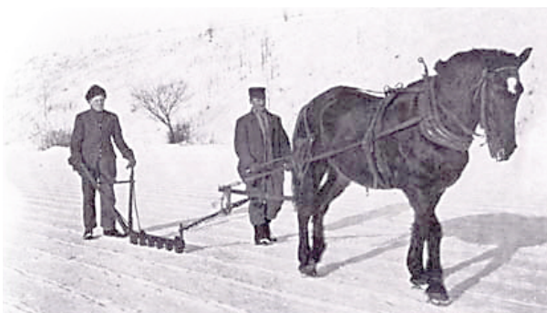
Ice harvesting in the 1890s.

tradition each year. The 2006 Ice Harvest is scheduled for 9 am on Saturday, January 14, 2006.